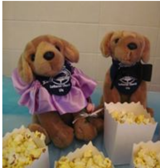
My plush mini-me's were in formal attire for the evening, too! They made such a cute couple.

Evidently, the same "No Treats" rule that applies to us Comfort Dogs does NOT apply to my little plush friends: