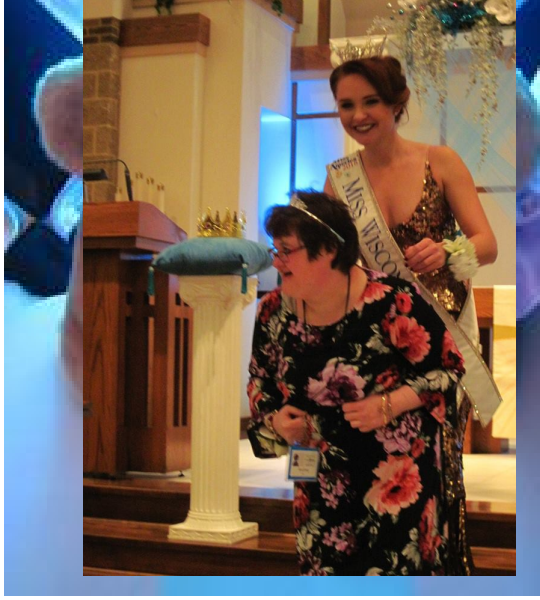
Miss Wisconsin was part of the crowning ceremony.